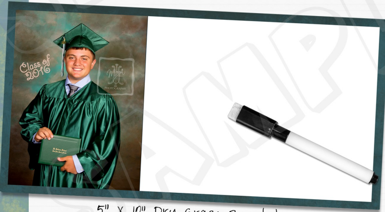
5" x 10" Dry Erase Board $31