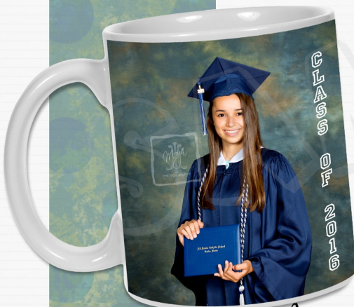
Ceramic Mug 11 oz. $19