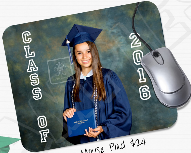
Mouse Pad $24